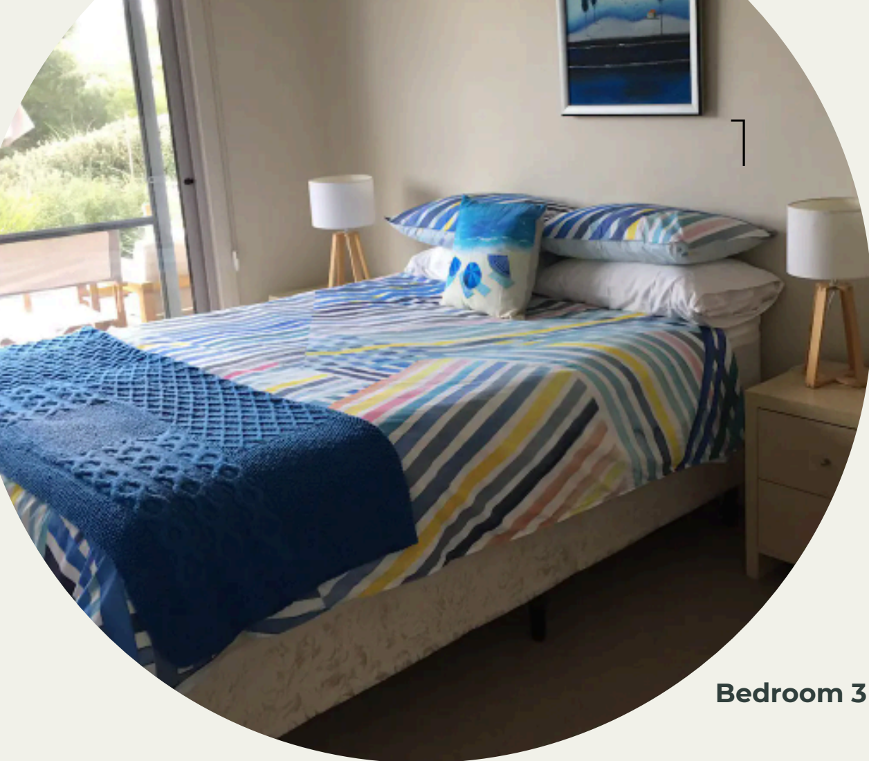
Bedroom 3 - ground floor