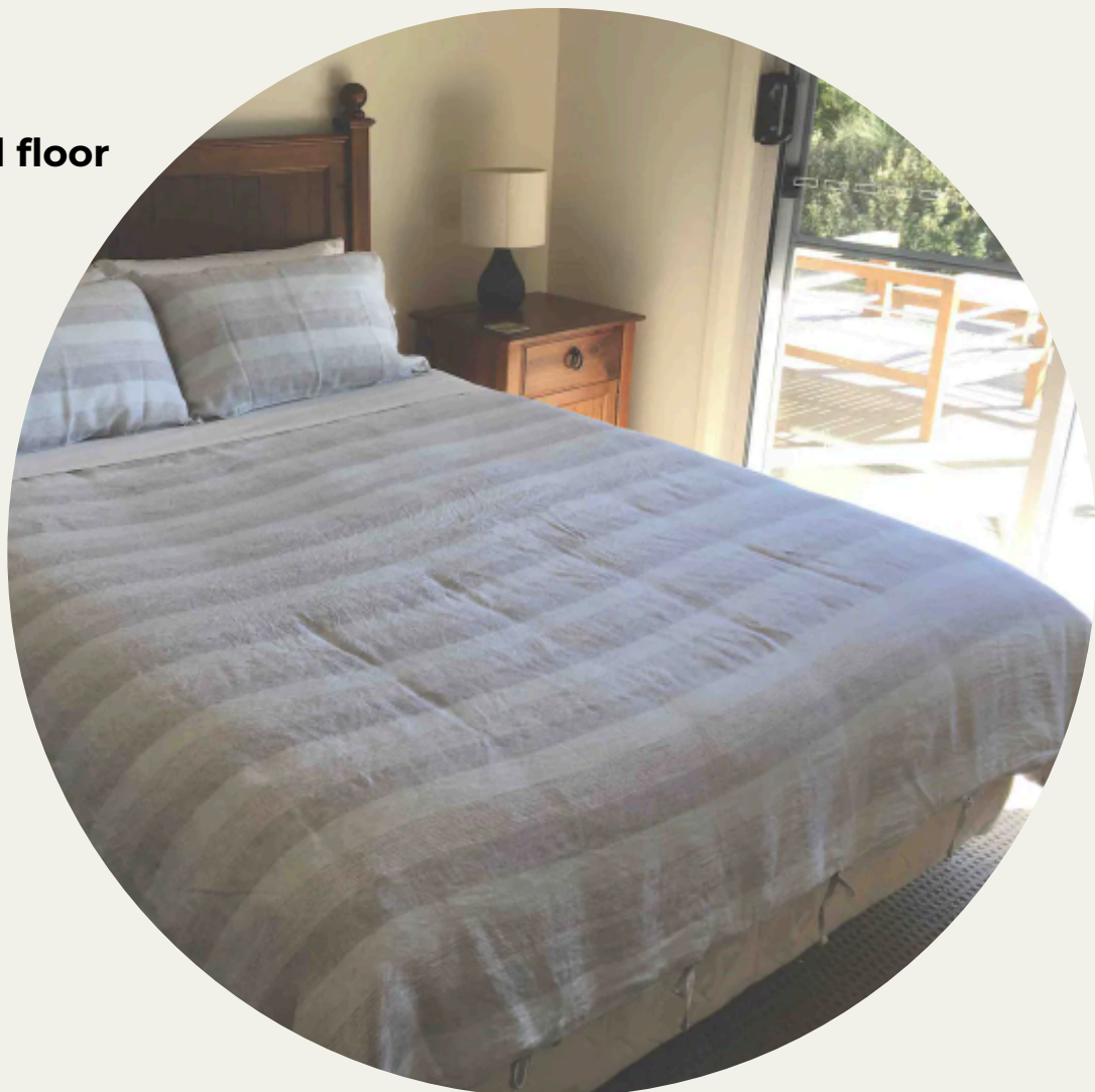
Bedroom 4 - ground floor