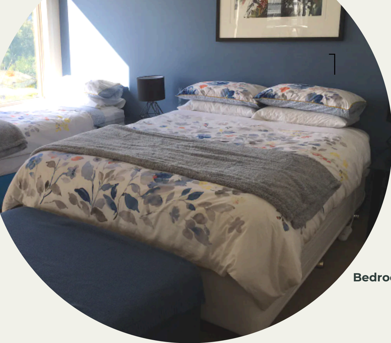
Bedroom 1 - upstairs